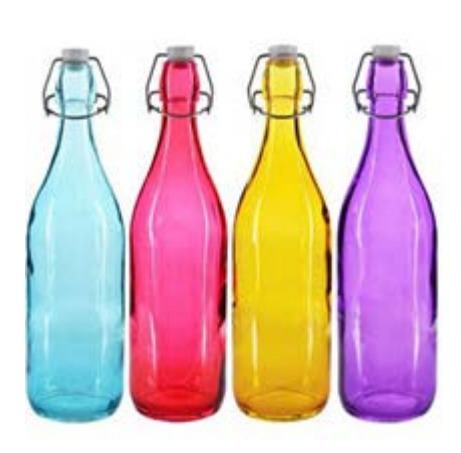
Message in a Bottle TALKING BOTTLES The latest Friends of Glass