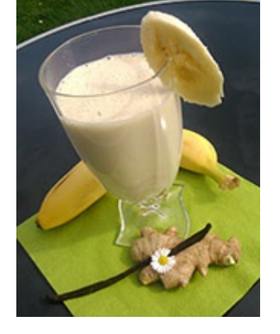
Message in a Bottle SMOOTHIE IN GLASS Soothe digestion, heartburn, nausea, and other stomach trouble with the fresh ginger in this natural remedy smoothie recipe.

SERVINGS: 2 1 banana, sliced 3/4 c (6 oz) vanilla yogurt 1 Tbsp honey 1/2 tsp freshly grated ginger